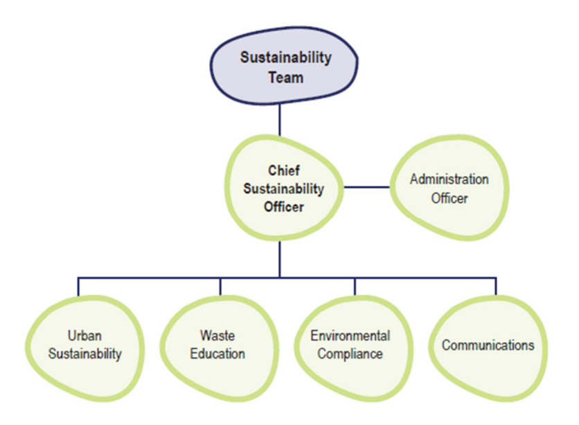
Figure 1: Sustainability Team organisational structure 2023.

The Sustainability Team comprises of Urban Sustainability, Waste Education, Environmental Compliance and Communications.