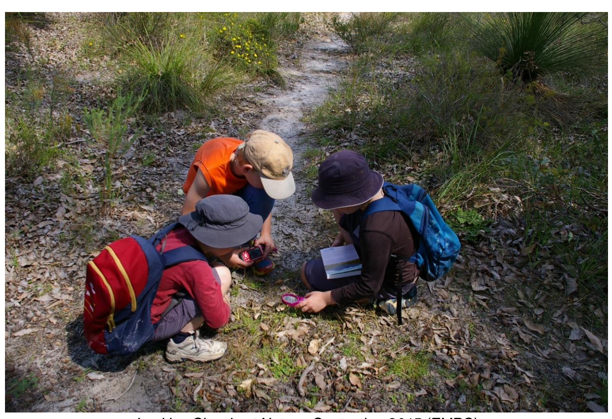
Looking Closely at Nature, September 2015 (EMRC)