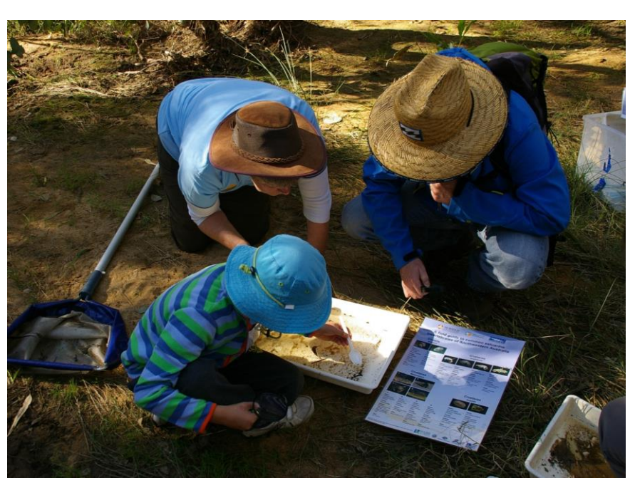
Healthy Creek workshop, July 2015 (EMRC)