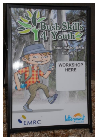
Bush Skills 4 Youth sign

BS4Y was developed in response to member Council priorities for community education and engagement to support environmental stewardship and has been one of the EMRC's most successful initiatives in recent years. A report to the EMRC's Council in December 2017 identified that due to the interest in the BS4Y, it was included in the successful State NRM Community Capability Grant which will provide funding until end of December 2018.