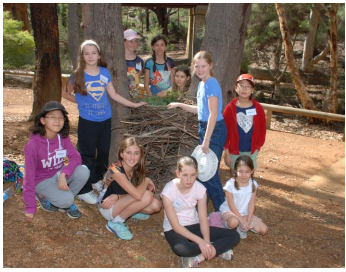
Where Eagles Soar Workshop, April 2016 (EMRC)