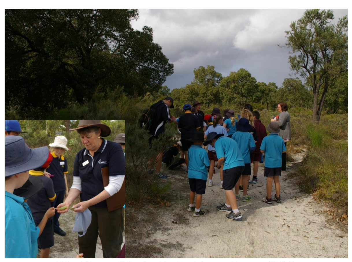
Midland Cluster at Talbot Road Bushland, Stratton, May 2015 (EMRC)

Promotion through Sustainable Schools WA resulted in workshops in the Shire of Mundaring, City of Bayswater and City of Swan. In the City of Kalamunda, the program was promoted via the council's website, word of mouth and through targeting specific schools with bush areas close by. Of the eight schools that expressed interest and engaged through planning meetings and phone calls, one workshop eventuated in this area. A partnership with the EMRC's Waste Education program was also trialled. Bush Skills 4 Youth workshops were offered alongside the waste workshops with five primary and one secondary school participating in 2016.