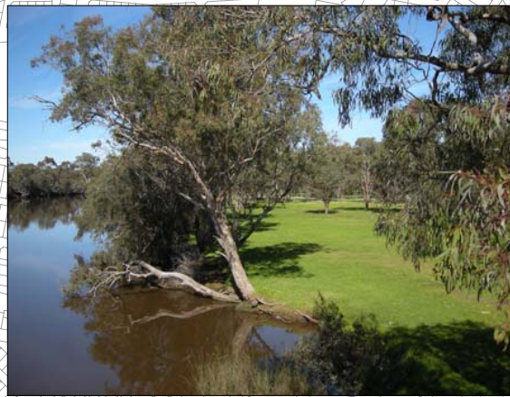
Foreshore between Guildford Rd bridge and Point Reserve.