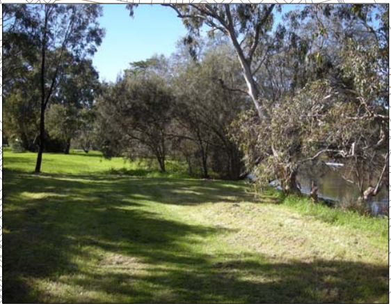
Foreshore north of Pickering Path does not present difficult construction conditions.