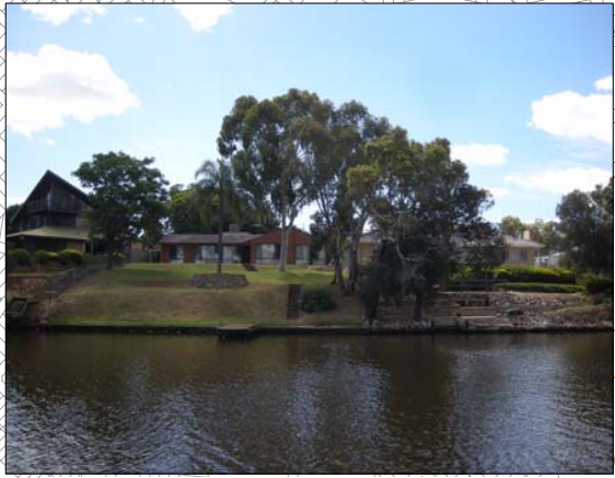
Floating boardwalks could be used where construction of paths is difficult.