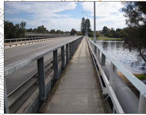
The path over the Garratt Road Bridge is inadequate and needs to be widened.