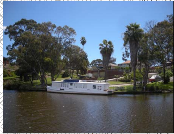
A major missing segment of path is between Kelvin St and Bath St.