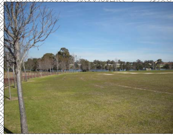
Missing segment of path between Slade St and the foreshore path in Riverside Gardens.