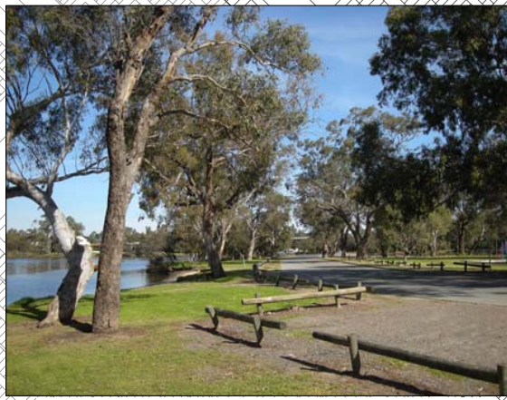
Cloughton Reserve is one of the long-standing 'missing links' in the path network.