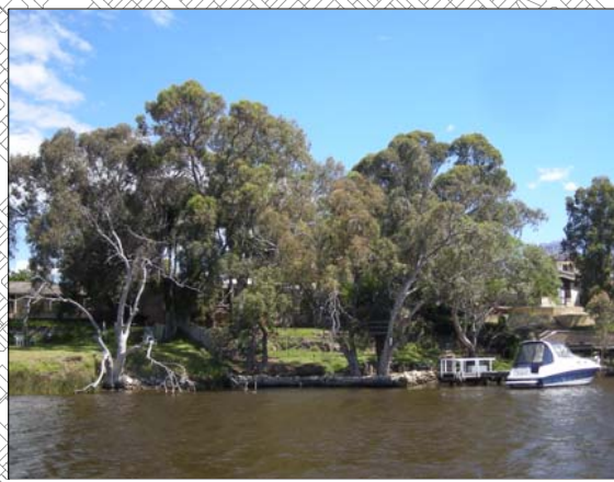
The foreshore near the 'former' Ascot Inn. A major missing link in the path network.