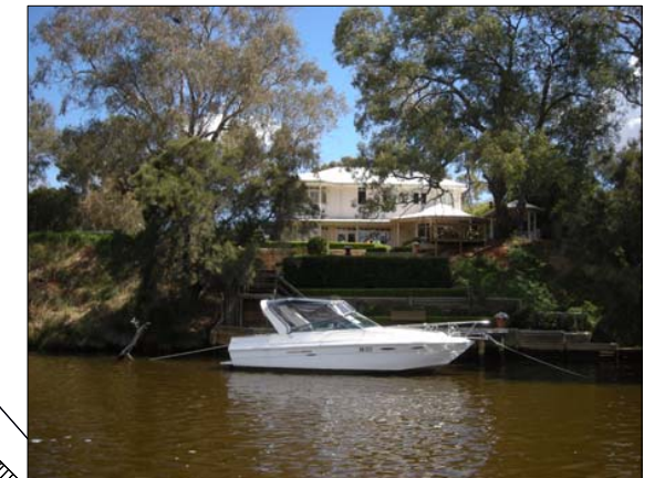
Private jetties and steep embankments (as is the case along Fauntleroy Ave) will require an innovative solution, such as a floating boardwalk.