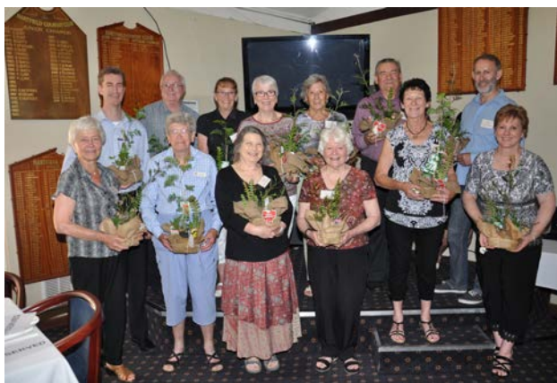
Some volunteers who attended EMRC End of Year Volunteer Event