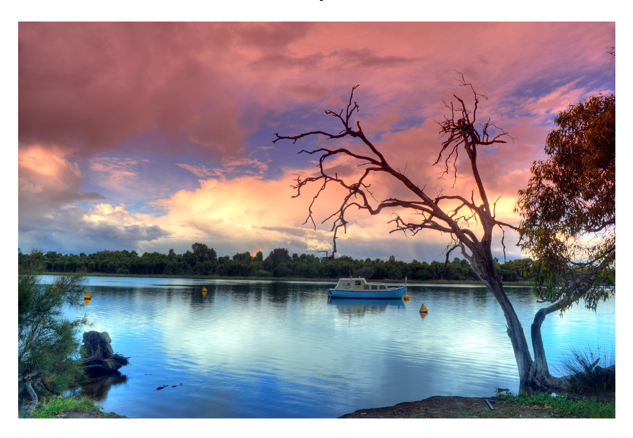
Page 1 of 58