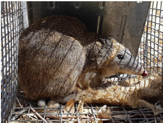
Southern Brown Bandicoot