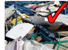
Dry C&I Waste