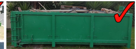
Roll On Roll Off